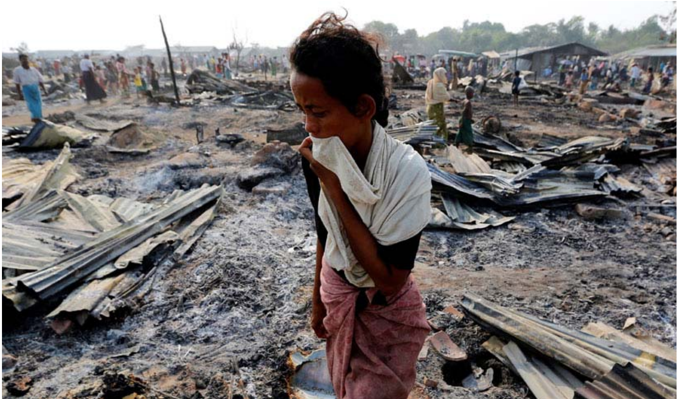
A woman walks among debris after fire destroyed shelters at a camp for internally displaced Rohingya Muslims in the western Rakhine State near Sittwe, Myanmar May 3, 2016.

Violence broke out in 2012, when a group of Rohingya men were accused of raping and killing a Buddhist woman. Groups of Buddhist nationalists burned Rohingya homes and killed more than 280 people, displacing tens of thousands of people. Human Rights Watch described the anti-Rohingya violence as amounting to crimes against humanity (PDF) carried out as part of a “campaign of ethnic cleansing.” Since 2012, the region’s displaced population has been forced to take shelter in squalid refugee camps. More than 120,000 Muslims , predominantly Rohingya, are still housed in more than forty internment camps, according to regional rights organization Fortify Rights.